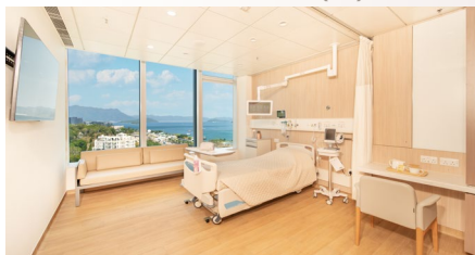
Private Room (1A)