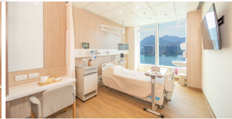
Private Room (1B)