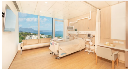
Private Room (1A)