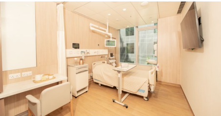
Semi-Private Room (2A)(1-bed)