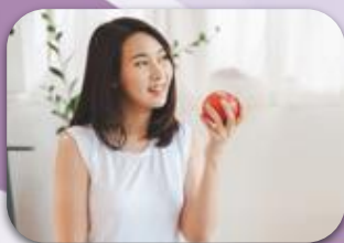
WomenCare Health Check Programme

Hang Seng Prestige Private, Prestige customers and Principal cardholders of Prestige World Mastercard