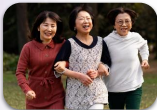
Holistic Medical Care for Menopause (Integrative Medicine)