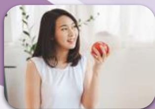
全康女士健康 檢查計劃

恒生優越私人理財、優越理財客戶及 優越理財World Mastercard主卡持卡人