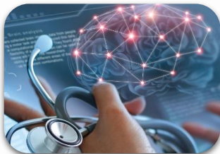
Brain Health Programme