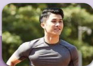
全康男士健康 檢查計劃