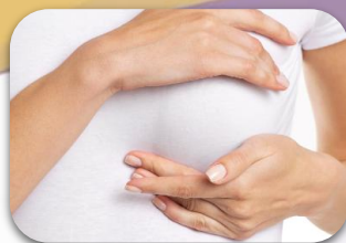
Breast Health Programme