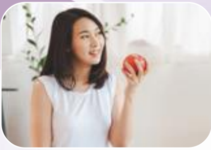
WomenCare Health Check Programme