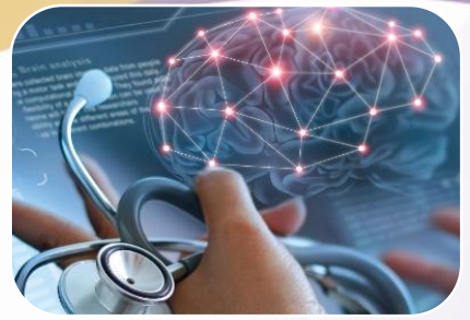
Brain Health Programme