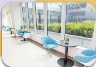
Prestige Health Check Programme