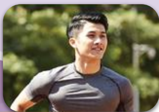
MenCare Health Check Programme