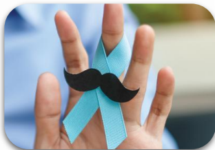
Prostate Health Programme