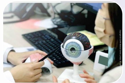
Eye Health Programme at Eye Centre