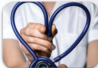
Heart Health Programme