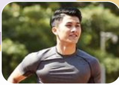
MenCare Health Check Programme